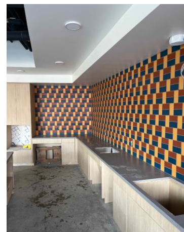
Building A Progress