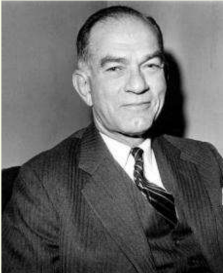
Senator J. William Fulbright ARKANSAS